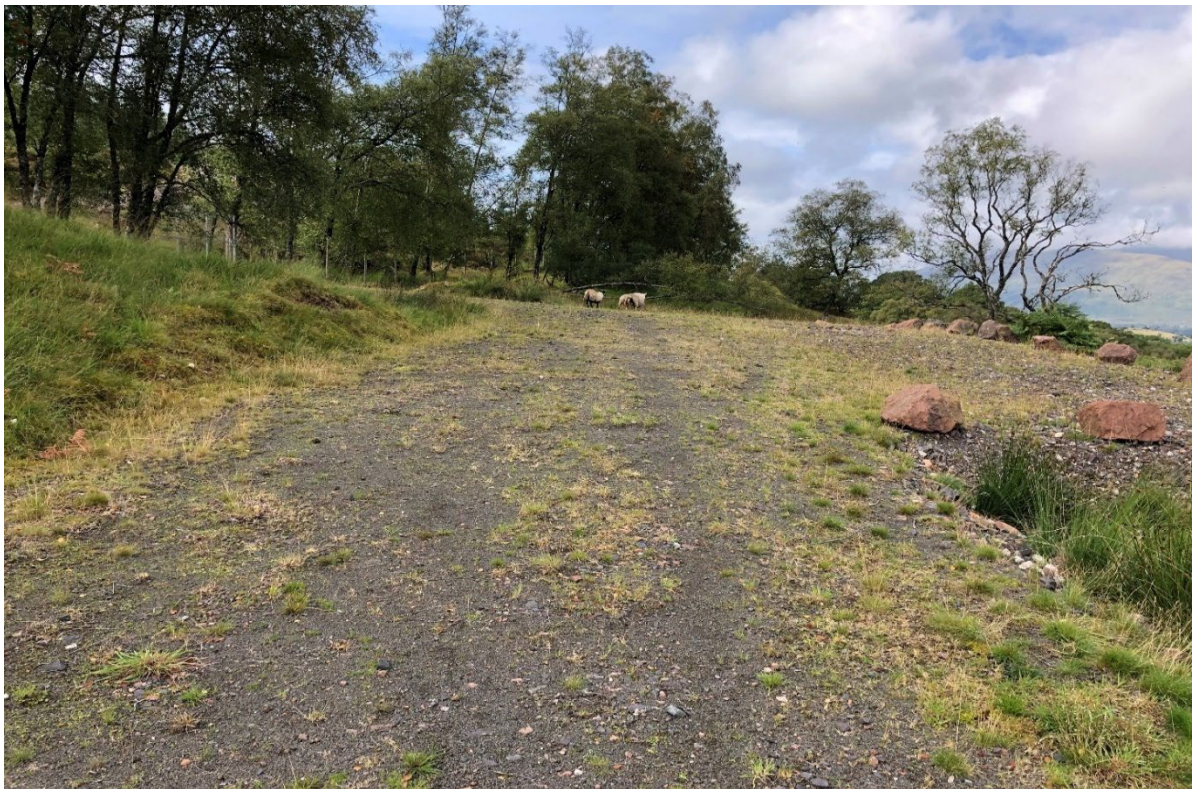
Plate 5.4: Looking south west along the access track section between towers 46 and 47 on the neighbouring property Brackley Farm.