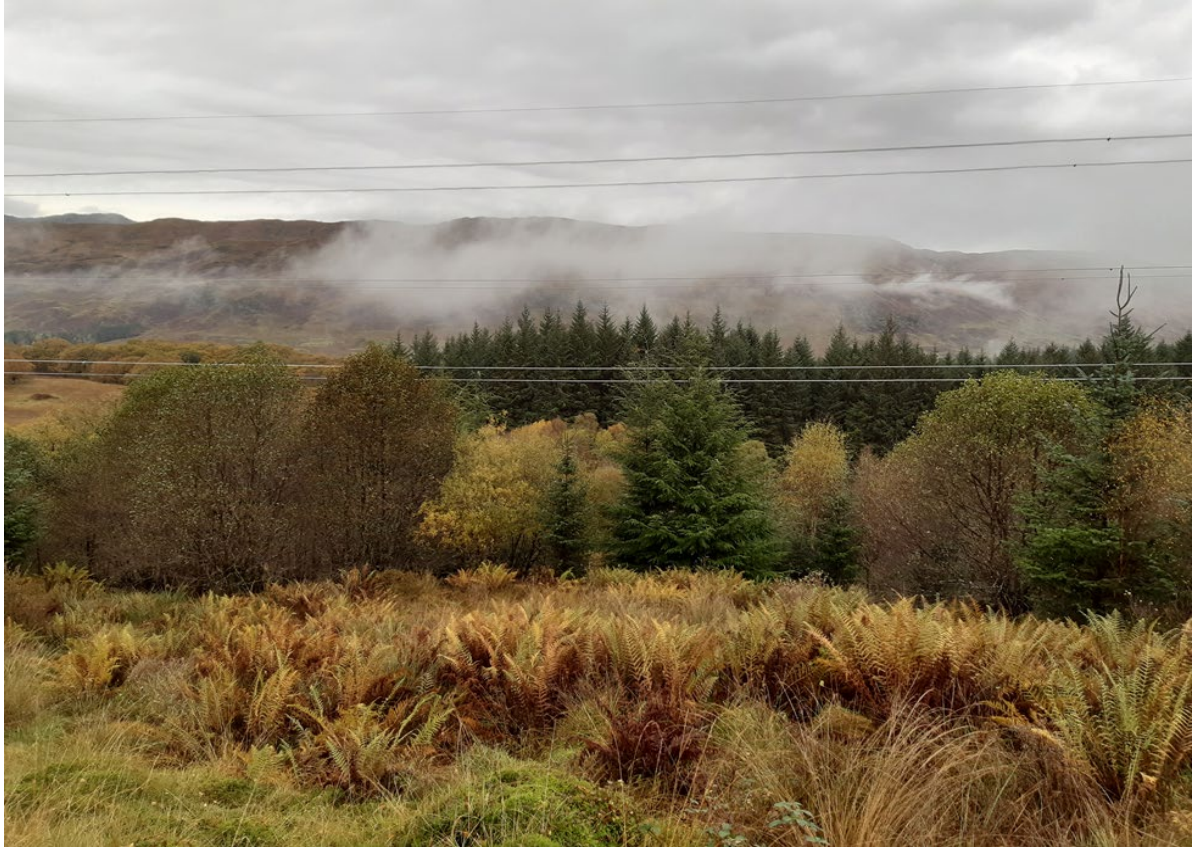
Plate 5.7: Looking north from tower location 47.