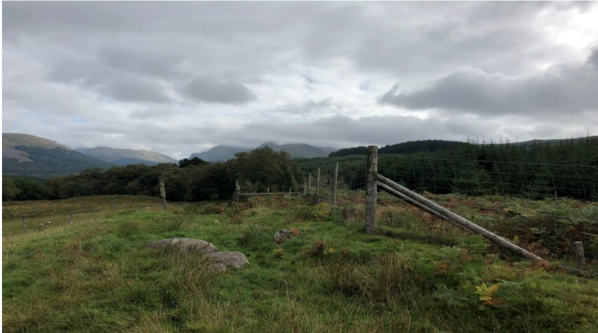
Plate 5.1: Looking east along the OHL alignment towards tower 45 to 46.

5.1.5 There are no formal environmental woodland designations present for the conifer woodland area.