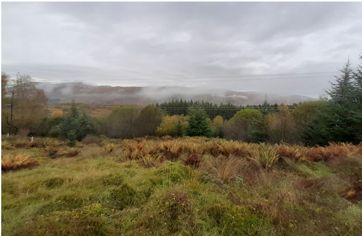
Plate 5.8: Looking north from tower location 47.