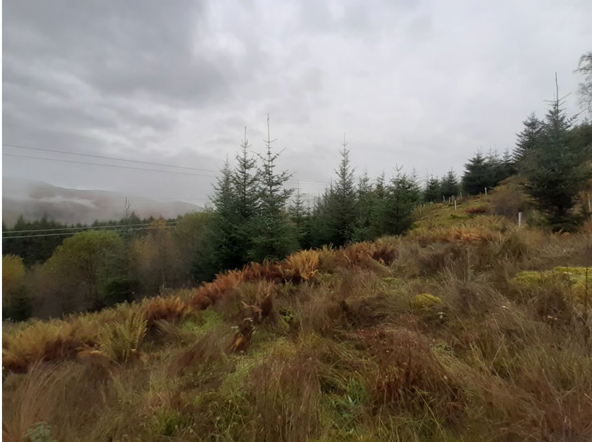
Plate 5.5: Looking east from tower location 47.