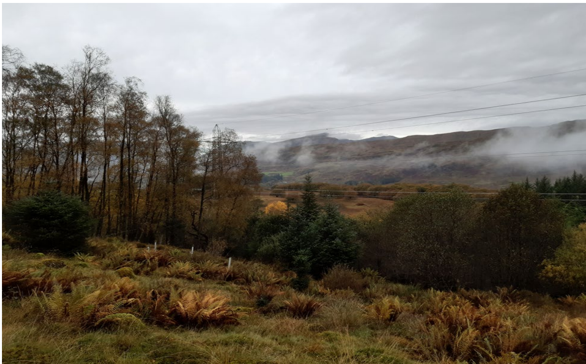
Plate 5.6: Looking north west from tower location 47.