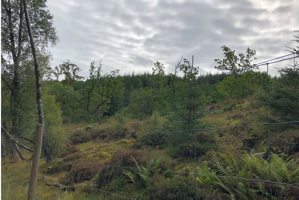
Plate 5.3: Looking north east from tower location 45.